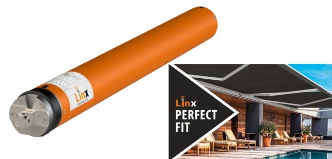
FOLDING ARM AWNINGS (3+ ARMS)

FOR ADDED PROTECTION, COMPATIBLE WITH: The Spinner Sun/Wind Sensor and The Shaker Motion Sensor