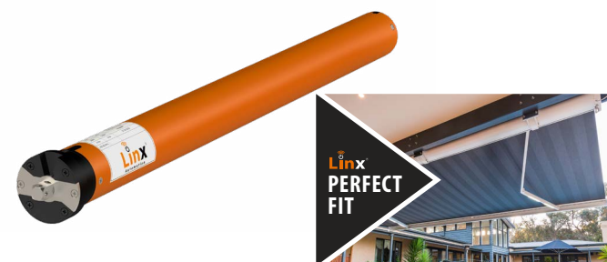
FOLDING ARM AWNINGS (2 ARMS)

FOR ADDED PROTECTION, COMPATIBLE WITH: The Spinner Sun/Wind Sensor and The Shaker Motion Sensor